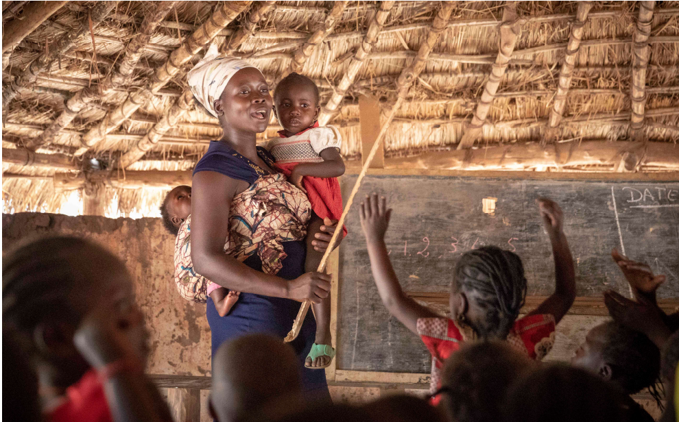
Preschool in the Makpandu refugee settlement in South Sudan, launched and run by the Youth Association for Peace and Development (YAPD), a refugee-run community group.