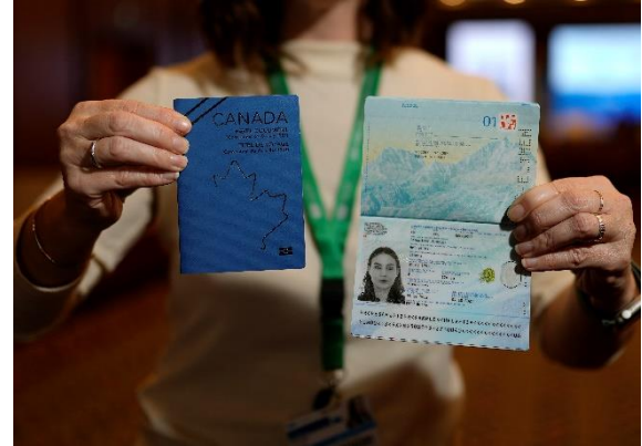
Figure 1 - Examples of MRCTD specimens