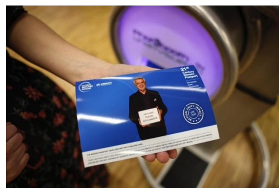
Figure 3 - High Commissioner Grandi at photobooth